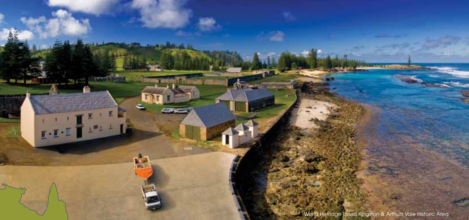
World Heritage Listed Kingston & Arthurs Vale Historic Area