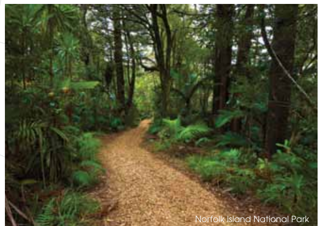
Norfolk Island National Park

Norfolk Island is a 3 hour flight from Melbourne, a 2 hour flight from Sydney or Brisbane and a 1.5 hour flight from Auckland. The eroded remnants of a basaltic volcano active over 2 million years ago, leaves the Island approximately 8 kilometres x 5 kilometres in size and boasting 32kms of coastline. Even though the Island is small, you'll want to visit us again to make sure you see all of it. And why wouldn't you when it is the home to 1800 of some of the friendliest people this side of the equator?